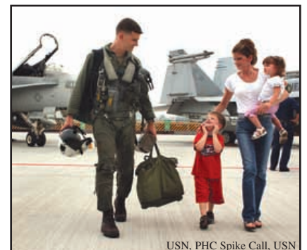
USN, PHC Spike Call, USN

P.O. Box 26626, San Diego, California 92196-0626 (800) 269-8267